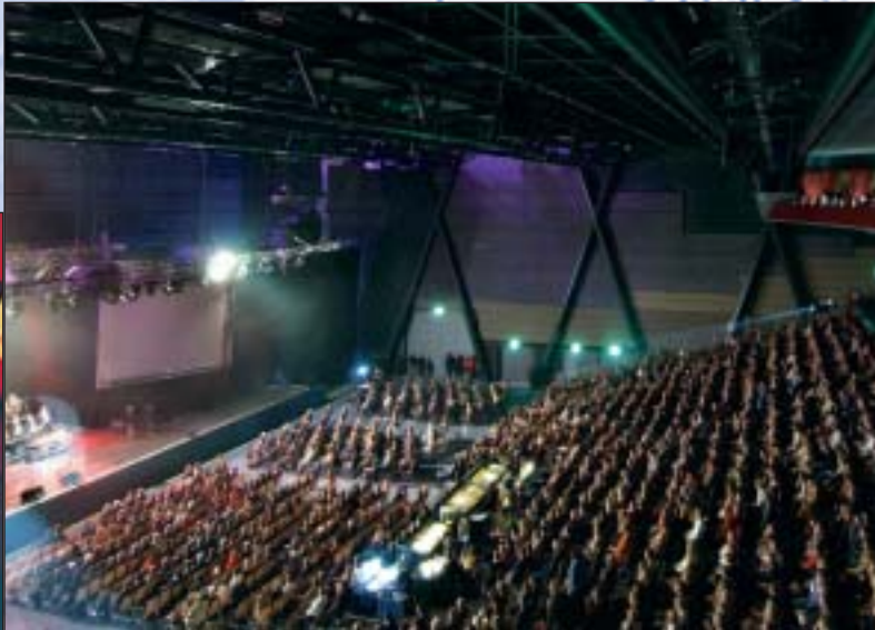
Concert in bigBOX Allgäu

Some great events foreshadow their coming: August is the time of the Allgäuer Festwoche festival, the highlight of the region's economic year. The event includes an extensive trade fair with over 400 exhibitors and a comprehensive programme of culture, sports and entertainment.