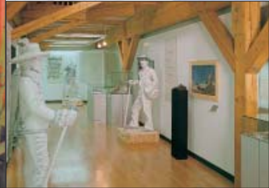
Alpine Museum in Marstall

Visit Archaeological Park Cambodunum (APC) and experience the living past of the Roman city of Cambodunum. It was here, 2000 years ago, that the people worshipped their gods. The excavations relate the story of daily life: the " Gallo-Roman Temple Precincts " with temple buildings and altars, the " Small Thermae " under a protective canopy and the foundations of the Roman city's forum - a kind of town hall, church and market square in one, surrounded by public buildings. The most impressive of these was the basilica, which was as large as the present St. Lorenz Basilica. As well as the "Small Thermae", the baths of the Roman governor, there was a much larger public bath, the "Large Thermae" with swimming pool, sauna and sports area. Prosperous citizens, merchants and restaurateurs lived in the central areas; to the south and north of the city were two considerably poorer outlying areas where artisans lived.