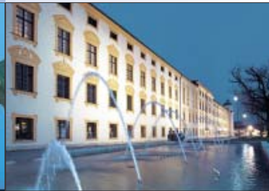
Residence of Prince-Abbots

KAMBODUNON (GREEK) - CAMBODUNUM (LATIN) - KEMPTEN. CELTIC IN ORIGIN, MEANING: FORTRESS OR SETTLEMENT AT THE BEND OF THE RIVER