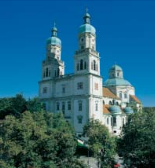
Basilica of St. Lorenz