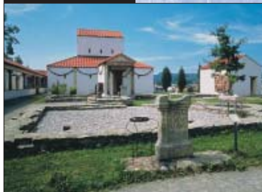
Gallo-Roman Temple Precincts in APC

Mountain climbing with a difference - in Kempten's Alpine Museum , the largest museum of Alpine history in Europe. It documents the development of the Alpine region and the toilsome lives of its settlers. Displays present flora and fauna of the region and trace the history of Alpine mountaineering - from Edward Whymper to Reinhold Messner. Skis, snowshoes and sports sledges and toboggans bring the history of winter sports to life.