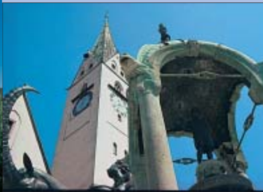
Church of St. Mang