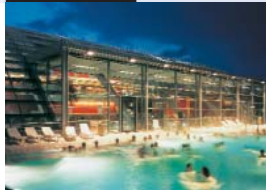
CamboMare Water Experience

Wallowing blissfully in warm, bubbling water , racing the kids down the lengths or whooping down the water slide. CamboMare is the perfect holiday thrill for all the family. Its water fun is rounded off by spacious sauna facilities with eleven different saunas, set in delightful grounds.