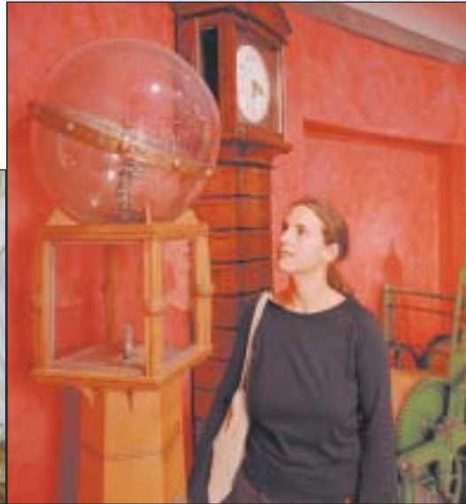
Allgäu Museum in Kornhaus