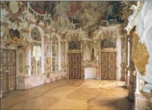
Throne Room in the Residence

The elegant rococo state apartments in the Residence were used by the Prince-Abbot on ceremonial occasions. The impressive apartments include the waiting-room and audience chamber, day salon and bedrooms, all in late Regency style, and the exquisite rococo Throne Room.